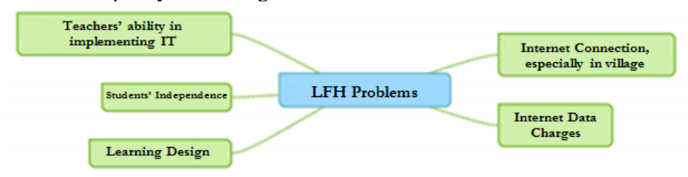
Figure 2: Problems in LfH

In such conditions, online learning during this pandemic can be said to have not been oriented to the quality of learning.