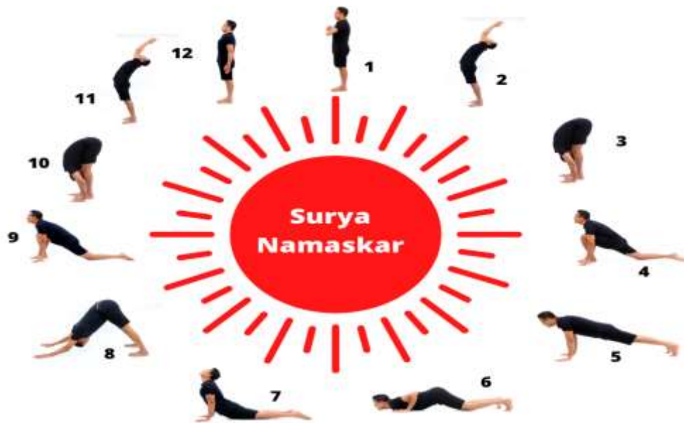
Figur 2. Twelve Asanas (postures) in Surya Namascara Yoga

Pranayama also has a good effect that teenagers can feel when practicing Surya Namaskara Yoga . Usually if the teenager is in an anxious state then the flow of breath is also less comfortable. So that adolescents who have less self-acceptance also usually do not observe themselves consciously, one of them is the flow of breath that should be grateful for. In yoga, pranayama is the fourth stage in Astangga Yoga . According to Iyengar (1966) pranayama comes from the word ' prana ' meaning breath or breathing, flow of life, vitality and energy or strength, while ' ayama ' means regulation. Based on its etymology, pranayama can be understood as the regulation of prana or life energy, thus prana is not limited to breath, since the breath is a tool of the flow of prana or life energy.