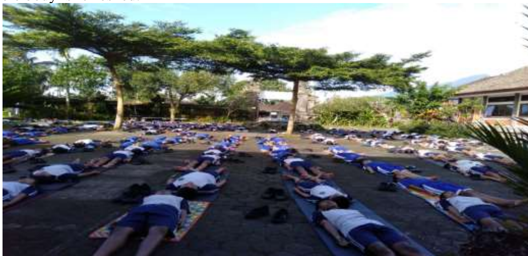
Figure 4. Teenagers Perform Savasana as The Final Practice and Relaxation of Surya Namaskara Yoga Practice.

When practicing Surya Namaskara Yoga , it takes some effort to carry out the sequence of body positions. This can be known from the elevated heart rate and deep breathing, which is connected with the sympathetic nervous system. Furthermore, the relaxation of Savasana gives the sympathetic nervous to works, by reversing the effects that appear, and returning the body to a balanced state. By combining Surya Namaskara and Savasana both aspects of the nervous system are automatically stimulated and the whole body is refreshed.