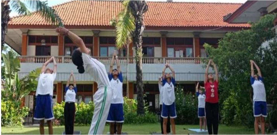
Figur 1. Teenagers at SMK Negeri 2 Denpasar Are Practicing Surya Namascara Yoga

Surya Namaskara Yoga is a series of twelve body movements in yoga. Svami Satyananda Saraswati in her book entitled Surya Namaskara (2002) explained that Surya Namaskara is an exercise body movement that originated in the prehistoric era. When man realized the existence of spiritual power in himself, which was reflected in the material universe. This is the basic of yoga teachings. Surya Namaskara , which means 'homage to the sun', can be seen as a form of sun worship, and all of it appears on both a microcosmic and macrocosmic level. In yoga term this signifies that the implementation of Surya Namaskara awakens the solar aspect of human nature and releases this vital energy for the awareness development. This can be realized by doing the practice of Surya Namaskara Yoga regularly every morning which is also an excellent way to homage to the source of creation and life, which makes it a tradition of sun worship.